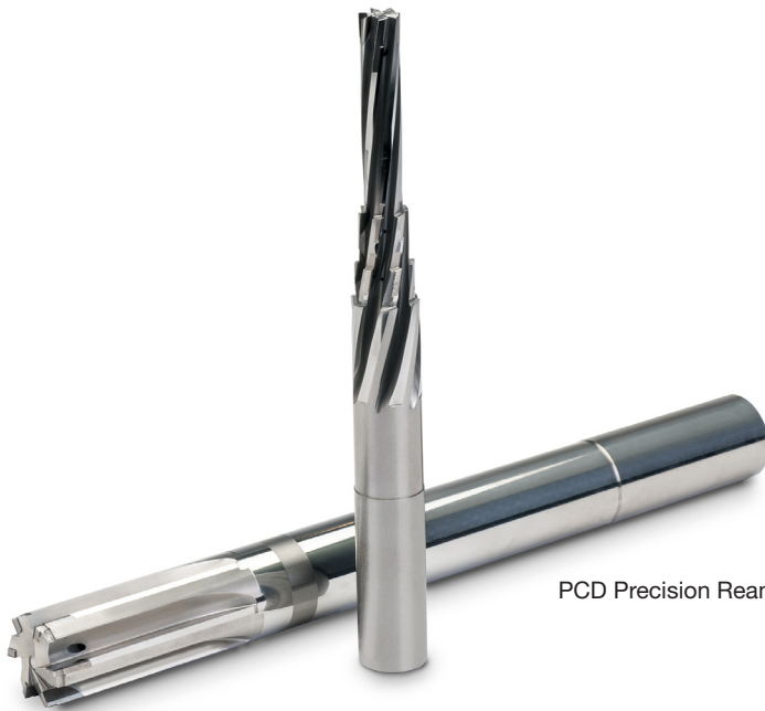
PCD Precision Reamers

Our multi-fluted, fixed pocket PCD precision reamer technology is proven to produce excellent bore roundness, surface finishes, and size control. These PCD precision reamers are available with multiple diameters to ensure optimum concentricity, straightness, and bore location.