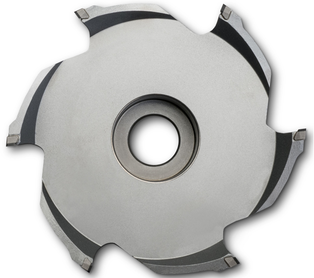
Milling Cutter (top view)